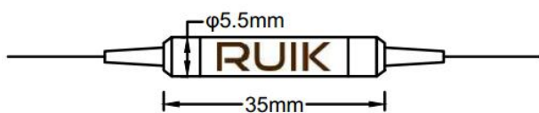
Max. Input Power:10W